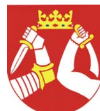
Regional Council of North Karelia