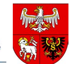
Marshal Office of Warmińsko-Mazurskie Voivodeship