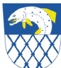
Regional Council of Kymenlaakso