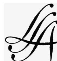
Association of Local Authorities in Lithuania