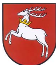
Marshal Office of Lubelskie Voivodeship