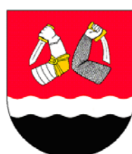
Regional Council of South Karelia