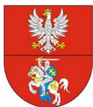
Marshal Office of Podlaskie Voivodeship