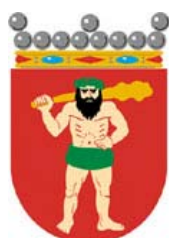
Regional Council of Lapland