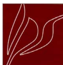
Latvian Association of Local and Regional Governments