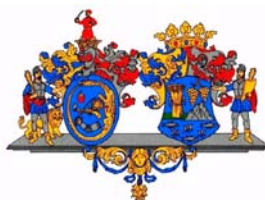
County Council of Hajdú-Bihar County